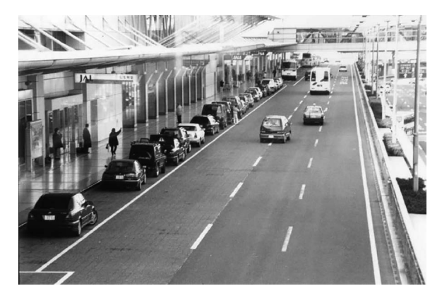
airport terminal / so

In this part, you can move to the next question by clicking on Next . If you want to return to a previous question, click on Back . You will have 8 minutes to complete this part of the test.